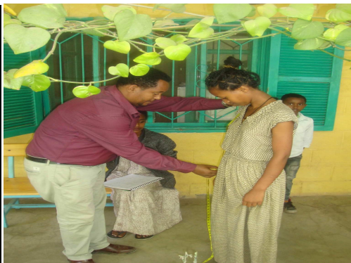
School children being measured for their new uniforms-just this past week.